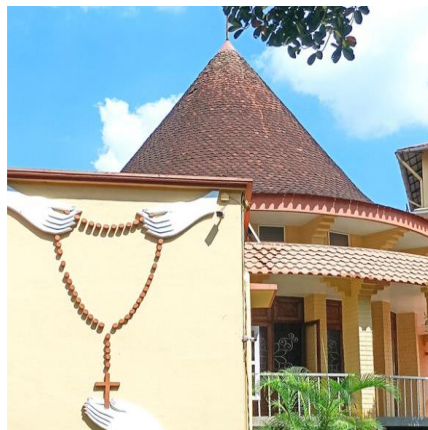
Exterior of the chapel

As the chapel approaches its fiftieth anniversary, plans are underway to