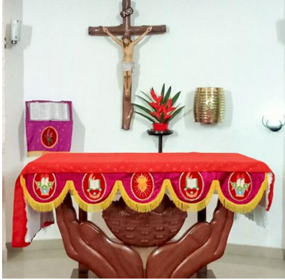
Altar and tabernacle

the house of a Judge to being acquired by the Holy Cross sisters and transformed into a place for discernment and prayer, it has seen quite a journey. The transition from a place of legal judgment to