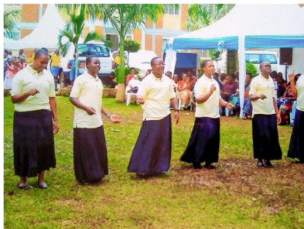
Congratulations dance by the candidates