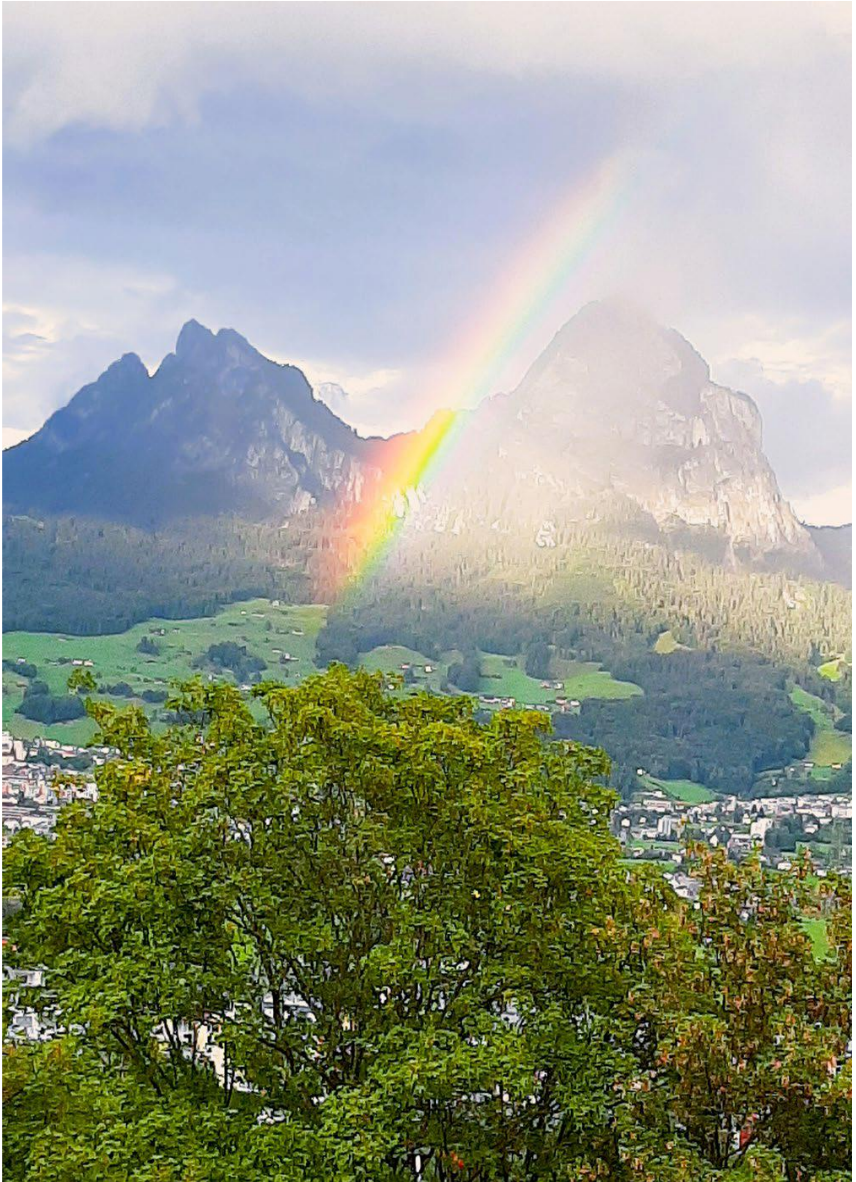
Rainbow between the Motherhouse and Mythen