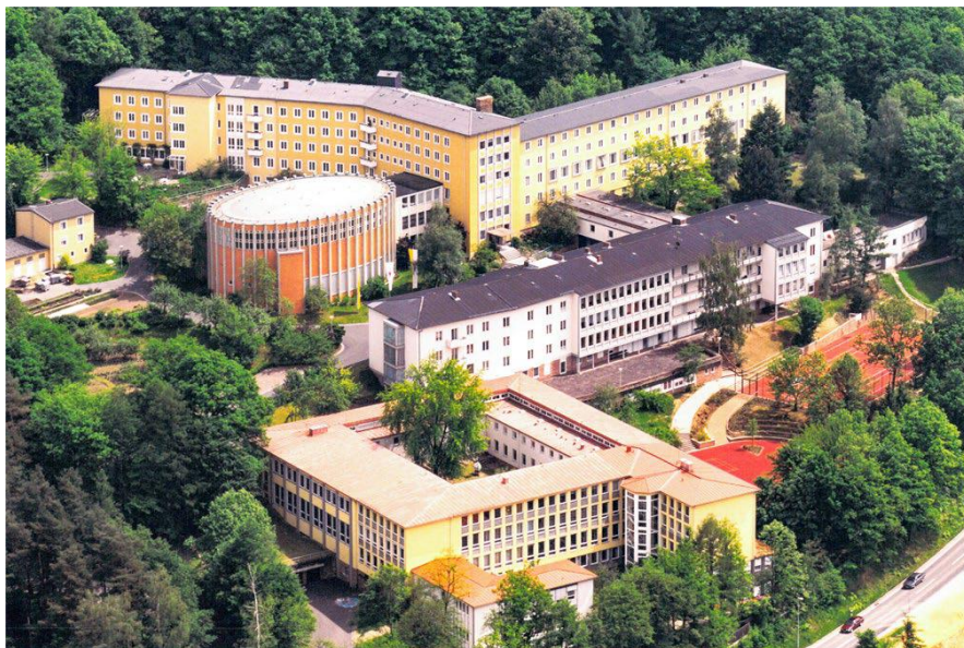
Convent and girls' education centre Gemünden

building complex from afar, rising above the last houses on the steep banks of the Main at the end of the town. Anyone seeing it for the first time is unlikely to think of a convent complex.