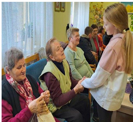
Encounters between generations

provide occupational therapy and keep the children physically fit. The programme also includes excursions and happy get-together with the staff. Educational programmes are also organised for relatives of these people. Other interested parties can also take part in these programmes. An important place are our gardens, raised beds and a spiral garden with medicinal and aromatic herbs. These plants are designed so that people with movement difficulties can take part in this occupational therapy and enjoy the fruits of their labour. Our team includes a retired psychologist who runs various workshops and is available for personal conversations with users of the day center as well as other people in need.