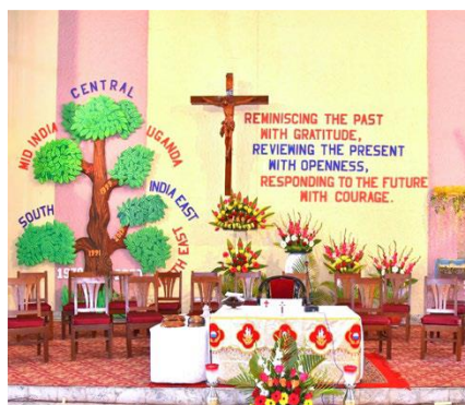
Ready for the solemn mass

62 batches of Novices committed their lives to the Lord in this Holy