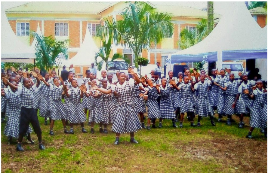
Presentation by the pupils

Our special thanks to the Indian Provinces for by sending the missionaries to the Vicariate, they made its establishment and growth possible. We thank all the Provinces and Vicariates who, with their prayers and financial support, have made it possible for the Vicariate of Uganda to flourish. We would also like to take this opportunity to thank all the benefactors specially from Europe and America who have helped in diverse and creative ways in the building up of the Vicariate.