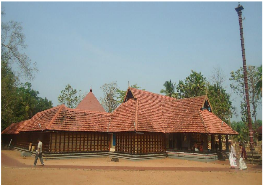
Exterior of the temple

This house has a rich history and transformation. From its origins as