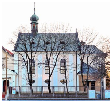
Convent church Podunajské Biskupice

Due to the increasingly deteriorating political and, above all, religious situation in Slovakia, the sisters in the Provincial House experienced a great trial of faith ( around 160 sisters). They lived in fear and uncertainty and under a lot of pressure as to what would happen to them. It was a time of the totalitarian regime. On the fateful day of 27 September 1950, the sisters were taken away from the Provincial House in three groups: