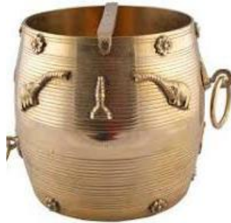
Measuring cylinder for rice

the house of a Judge to being acquired by the Holy Cross sisters and transformed into a place for discernment and prayer, it has seen quite a journey. The transition from a place of legal judgment to