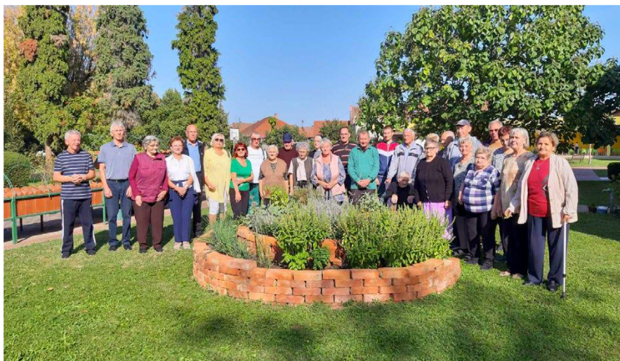
Daytime residents in the garden

There are many administrative tasks waiting at the background: Preparing projects, writing reports, preparing content for social media and communicating with the media. The most diverse professions have a place here and make a