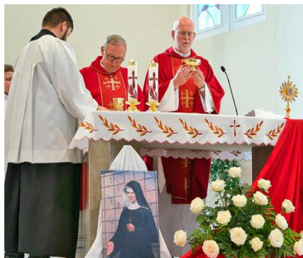
Triduum Mass for the feast of Blessed Zdenka

attended by pilgrims from the surrounding area. There is always a different preacher. He is often accompanied by the faithful from his parish. Many pilgrims from all over Slovakia, but also from abroad and overseas, find help, comfort, strength and spiritual refreshment here at the relics of Blessed Zdenka. Blessed Zdenka, pray for us!