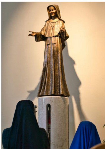
Main reliquary of Blessed Zdenka

Every last Saturday of the month, pilgrim masses are celebrated in this church in honour of Blessed Zdenka,