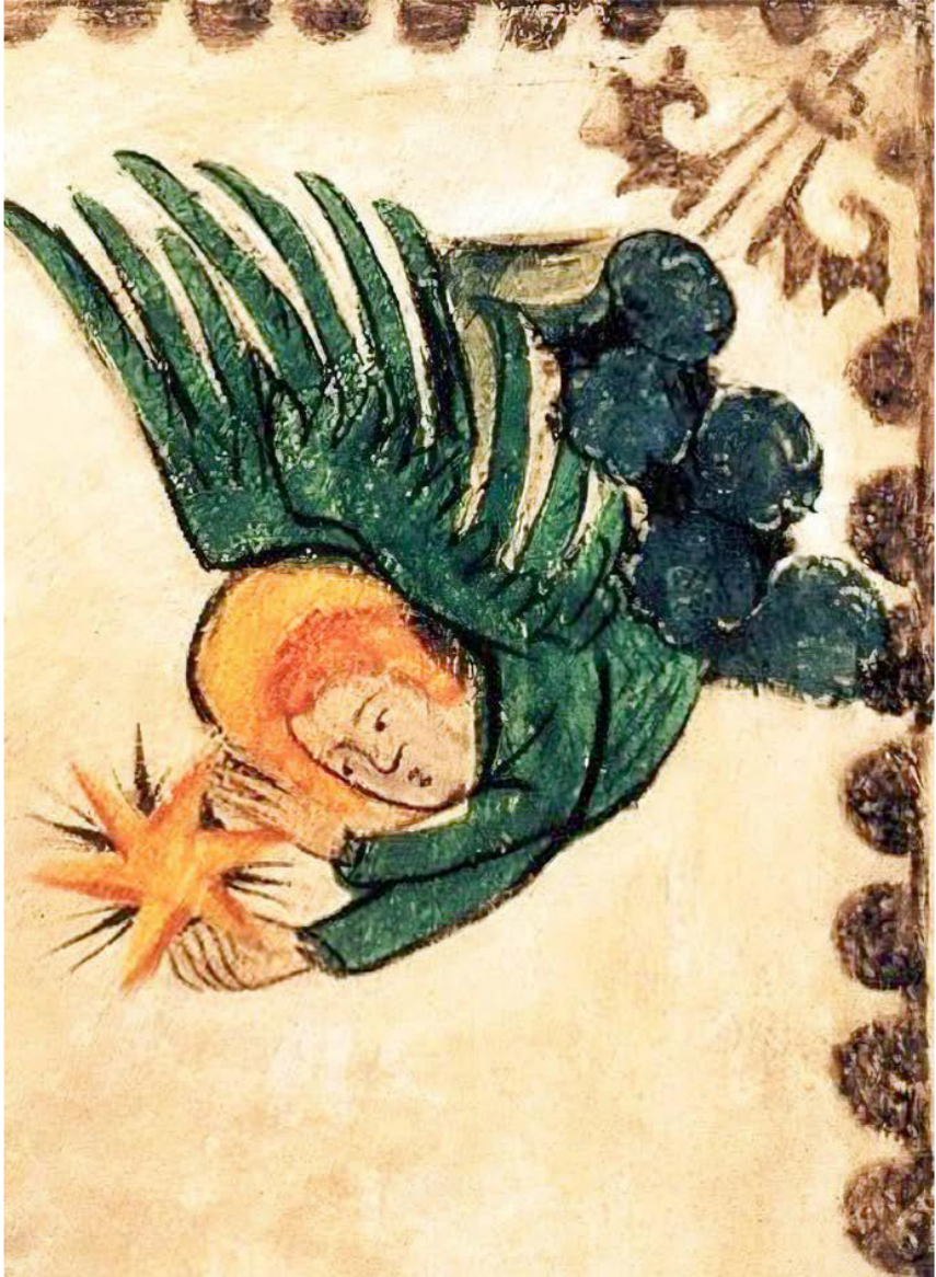
The Basel Münster crypt, 14th century, Photo: Erik Schmidt