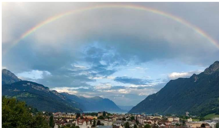
View from the convent to Brunnen.