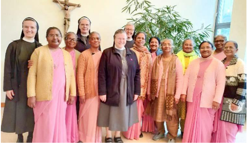
First group with the General Team

paths through which God wants to lead us today.