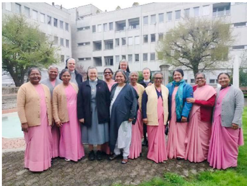
Second group with the General Team

can say indeed “Love knows no measure”. The sisters were very accommodative of us and sat with us, eagerly listened our sharings. As a whole it was a very homily atmosphere and we felt one as Holy Cross Sisters.