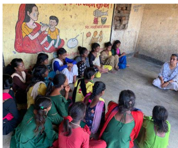
Education to fight against poverty

As Jeff Brown, the author of the Uncommon Bond says, "Compassion is not just a word. It's a way of being. It's not just a concept. It's love in action." Its challenge and invitation to make visible the motto of our congregation, "The need of the time is the will of God."