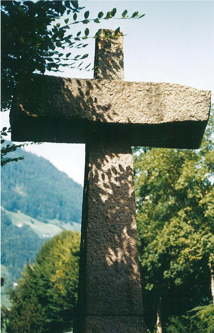
Stone cross from the crypt