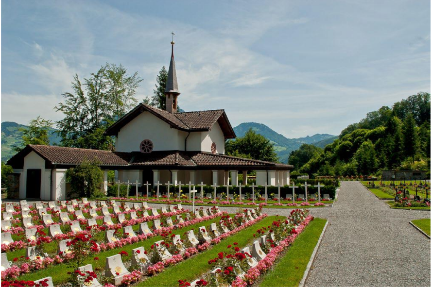
Part of the sisters' cemetery in Ingenbohl

From 1st January 2022 to 31st December 2022