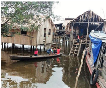
Living in Amazon region

It was initiated for children and young people to learn how to play musical instruments, such as the recorder, guitar, keyboard, etc. The children live in the district of Itapeaçú in the city of Urucurituba - in the Amazon region of Brazil, where our sisters began their mission five years ago. The project was initiated out of my concern that the children were without opportunities to develop their talents and gifts. In addition, mothers were seeking help for their sons and daughters to protect them from use of drugs and violence and from the risk of suicide.