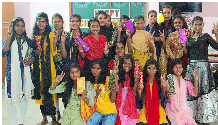
Dalit girls at Jeevdhara hostel

Heart-breaking real-life painful situations are hard to endure. For an example a 12-year-old girl came to our campus in tears. Despite her interest to continue studies, her parents wanted to marry her off. She told us that she was frightened to return home. Since we were helpless, we had to send her back home. Unfortunately, after a few months she was compelled to marry. Mostly girls, are married at a very early age and frequently to older men. The results of early marriages are a lengthy widowhood.