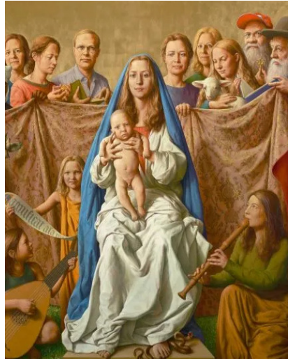
Sacred conversation (Photo: gallery Schwind)

Let us still ask ourselves today: What will become of us as a