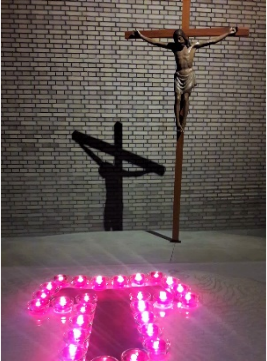
Transitus celebration, convent church, Ingenbohl, 3 rd October, 2022