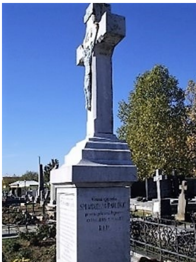
Graves of Provincials in Đakovo