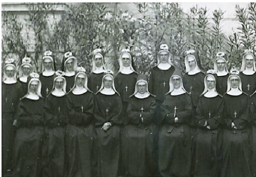
Final profession in Đakovo, 15 August, 1932