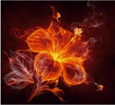
Flower at night

Various experiences have also brought me into contact with never imagined dark sides of the Congregation. Where there is much light, there is also much shadow. Some of them lost their terrors because they could be looked at together and changed in the light of God.