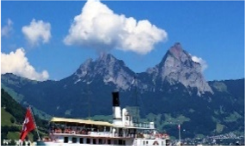
Lake Lucerne and myths