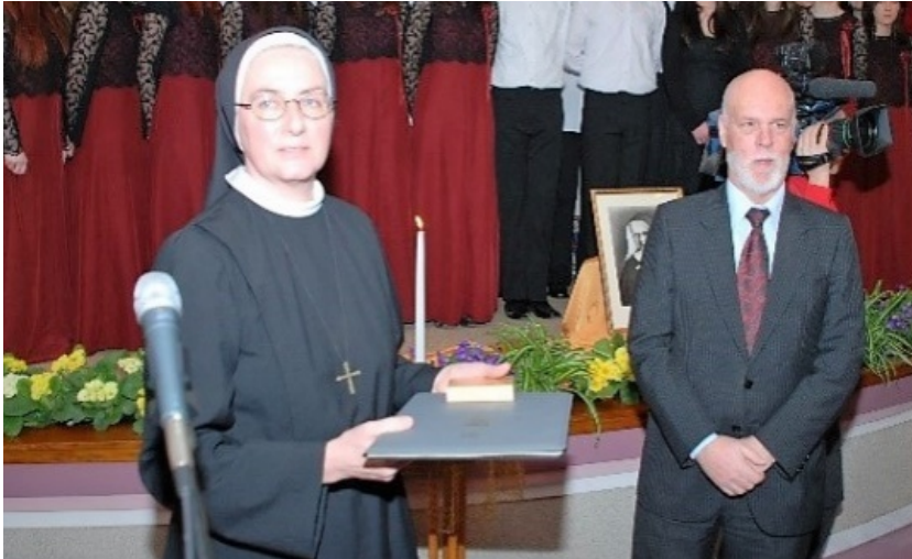
Being awarded the title "Righteous among the Nations"