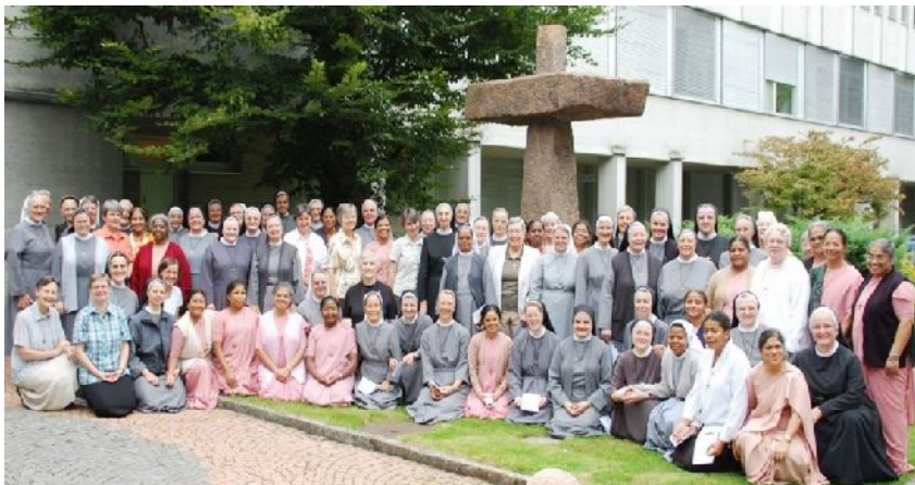
General Chapter 2014 in Ingenbohl

process requires a long-term concept and must be supported by all of us.