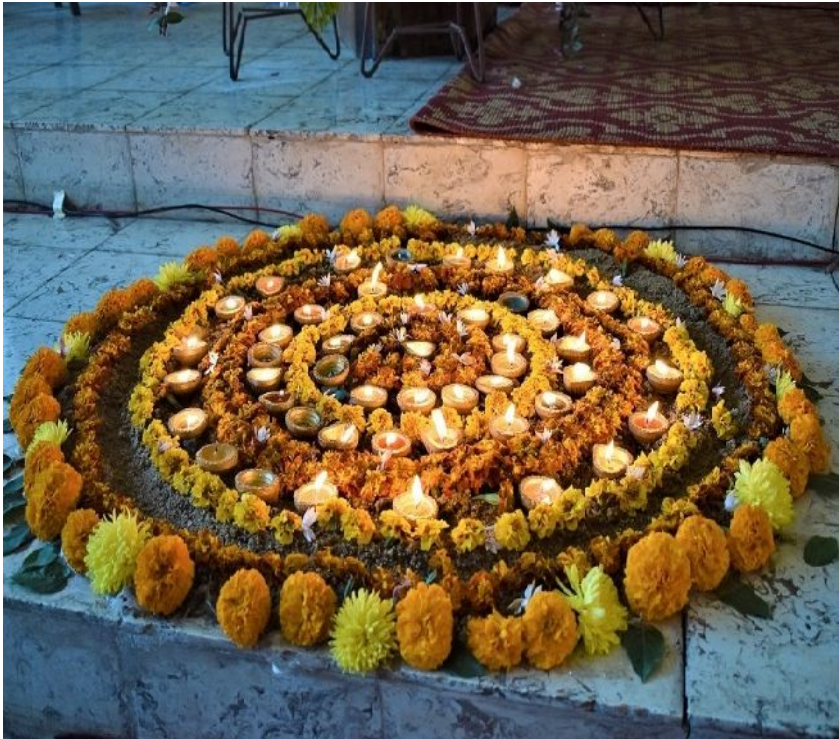
50 lights, thanking for 50 years