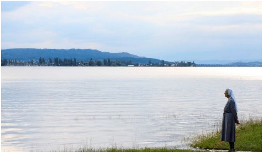
Hegne at Lake Constance.