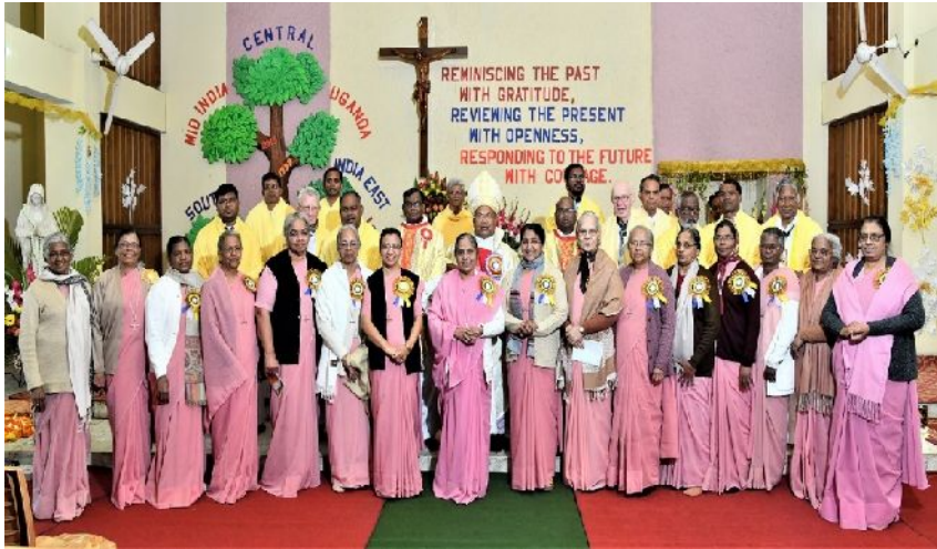
Indian Provincial Superiors with the Bishop and the priests