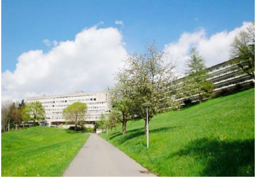
Way up to convent Ingenbohl

must confess that I am anxious about the future, I can say strengthened by the grace from above, that I am not afraid!" This is what she writes in a letter to the sisters.