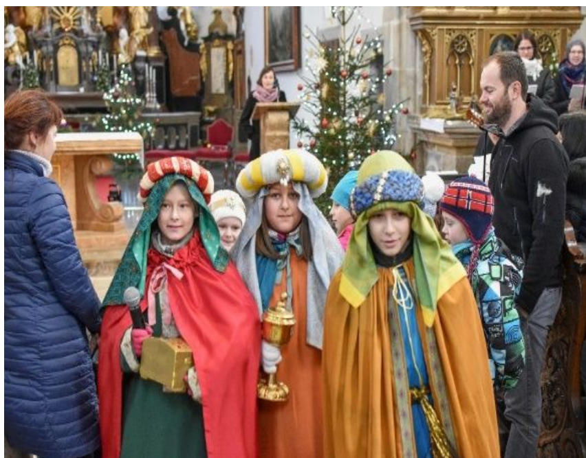
Live nativity scene in Kájov

We are very happy that the sisters always visit our Easter fair. They also help us by carol singing at the Christmas tree or in the St. Nicholas Church in Boletice.