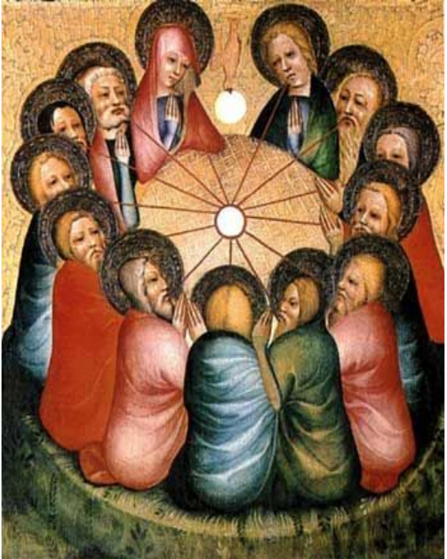
Pentecost, Westphalian artist, around 1380, today in Wallraf-Richartz-Museum in Cologne