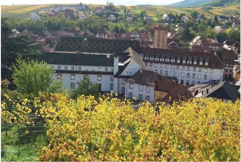
Convent of Sisters "of the Divine Providence" in Ribeauvillé, Elsass (France)