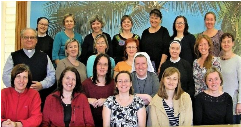
Mothers' meeting in the provincial house in Krom íž

During this time we have the opportunity to meet sisters who also like to participate. The sisters continue with the program in the afternoon. They share their experiences of life and activities, or we discuss other religious topics. We conclude our meetings with a common prayer.