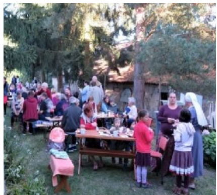
Garden party in Kosova Hora

At the last garden party, we also celebrated the first anniversary of the outpatient hospice "Flügel". They praised and thanked the nurses for their difficult but very important work in our area. It is an ecumenical project which receives no financial support from the